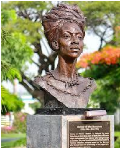
Royal Bust: Indomitable Queen Nanny of the Maroons Chieftainess of the Windward Maroons Daughter of God